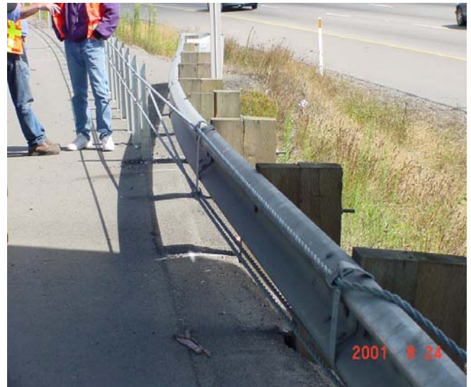
FIGURE 3 Washington State cable barrier transition to W-beam guardrail