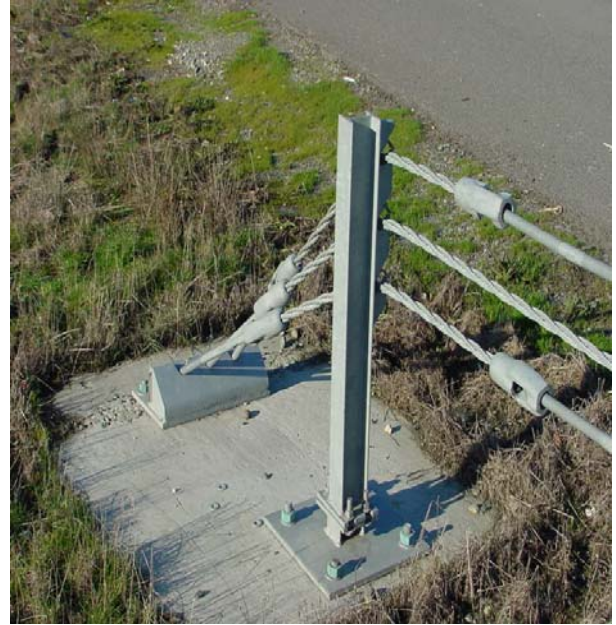
FIGURE 2 Washington State cable barrier terminal